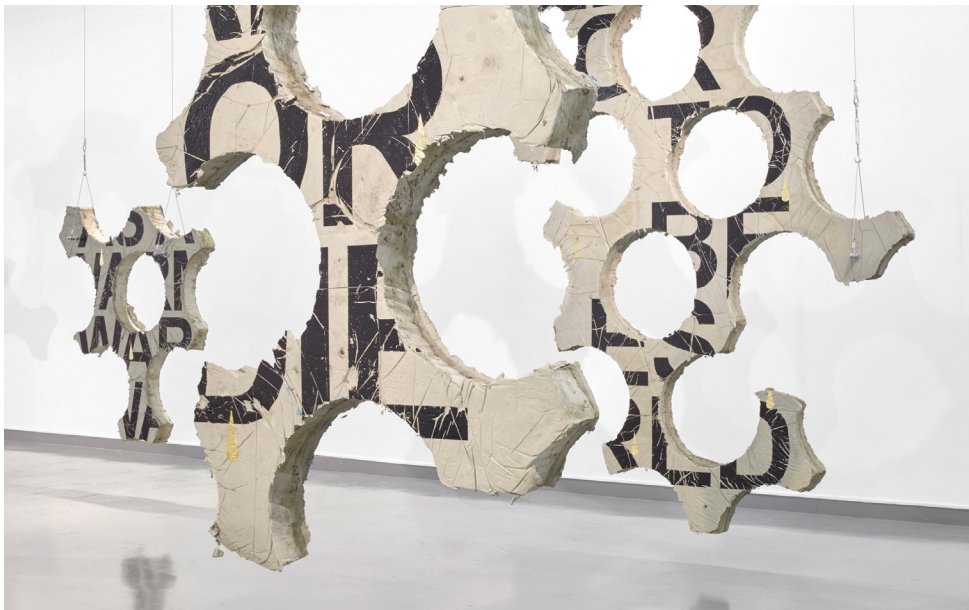
View of the solo show "Sírrete de mi, sírveme de ti" at Proyecto Amil Lima (Peru), 2016