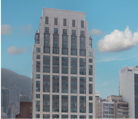
Hong Kong 50 Connaught Road Central