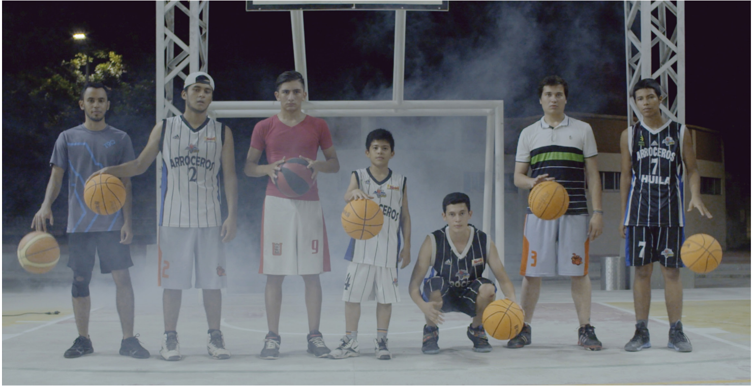
Iván Argote “As Far As We Could Get” (still), 2017. Video HD

When I was a kid, someone told me that a man dug a hole so deep that he stepped out of it on the other side of the world. Standing on firm ground, I wondered why this man, in fact, did not fall out of the earth and exit it upside down. In Iván Argote's new film “As Far As We Could Get” which contains documentary and fictional elements, he digs an imaginary channel from Indonesia to Colombia, or from the municipality of Palembang to a town called Neiva. The two cities are exact antipodes (a rare coincidence that only six more cities share worldwide). In both locations, the artist rented large billboards to announce simultaneously a feature film named, “La Venganza Del Amor” (The Revenge of Love). As if in a novel by Jorge Luis Borges, the title of his gallery show in New York is announced through a pyramid of interrelated information—stemming from a billboard announcing a fictional film documented by the artist's camera, we read the title of the art exhibition that we are currently visiting.