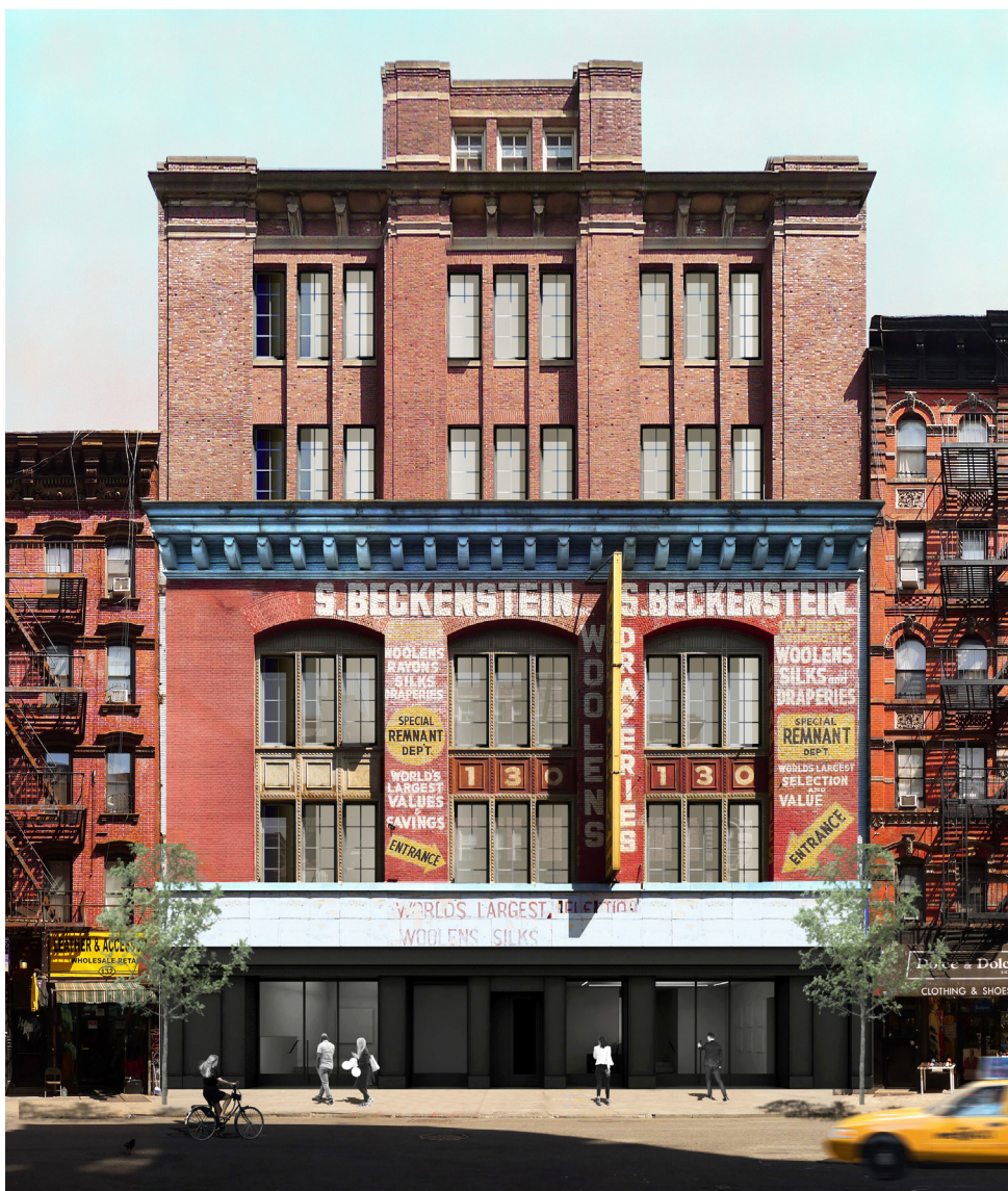
Facade of Perrotin gallery, 130 Orchard Street, New York

Along with the Paris, Hong Kong, Seoul and forthcoming Tokyo-based galleries, this new location will offer greater flexibility and will enable Perrotin to continue staging ambitious projects and large-scale exhibitions for its world-renowned artists. The new space will offer great flexibility to the gallery's varied group of artists for their exhibitions. The move affirms the gallery's loyal to its programming and passion towards discovering new talent since its establishment in Paris in 1989. The new location will serve as the base for a growing New York team.