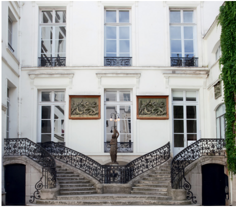
Paris 76 rue de Turenne, Marais