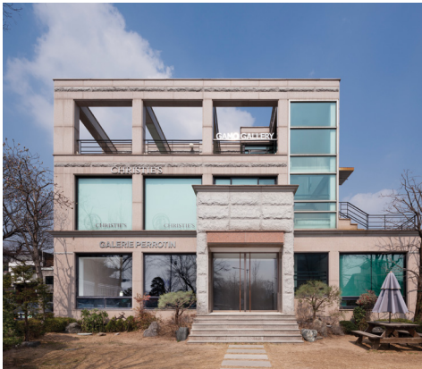
Seoul 5 Palpan-Gil, Jongno-Gu