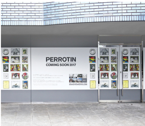
Tokyo Piramide Building, 6-6-9 Roppongi, Minato-Ku